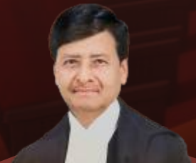
HON'BLE MR. JUSTICE AJAY RASTOGI

Former Judge Supreme Court of India 🕒 12:58 PM - 1:06 PM