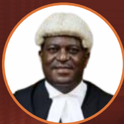
HON'BLE DR. JUSTICE MUMBA MALILA

Chief Justice Supreme Court of the Republic of Zambia