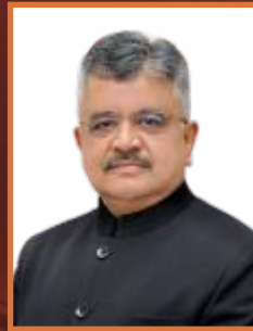
MR. TUSHAR MEHTA Solicitor General of India