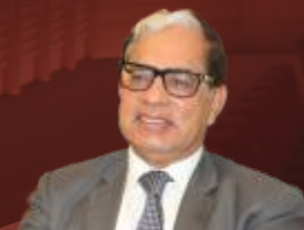
HON'BLE MR. JUSTICE MADAN B. LOKUR

Former Judge Supreme Court of India 🕒 12:26 PM - 12:34 PM