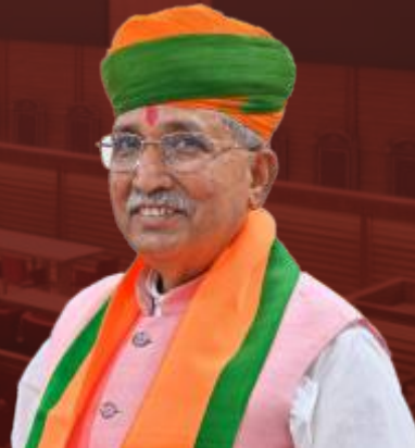
MR. ARJUN RAM MEGHWAL

Hon'ble Minister of State for Law & Justice (IC), Government of India