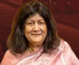
HON'BLE MS. JUSTICE INDIRA BANERJEE

Former Chief Justice of India 🕒 12:42 PM - 12:50 PM