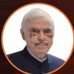
HON'BLE MR. JUSTICE P. SATHASIVAM

Judge, Supreme Court of the Republic of Tajikistan