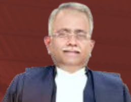
HON'BLE MR. JUSTICE SARASA V. BHATTI

Judge Supreme Court of India 🕒 11:30 AM - 11:38 AM