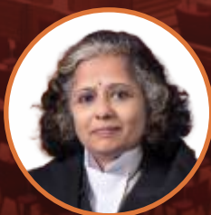
HON'BLE MS. JUSTICE ASHA MENON