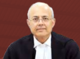
HON'BLE MR. JUSTICE MANMOHAN

Judge Supreme Court of India 🕒 11:38 AM - 11:46 AM