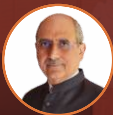
MR. NALIN KOHLI Senior Advocate Supreme Court of India