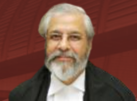
HON'BLE MR. JUSTICE MADAN B. LOKUR

Former Judge Supreme Court of India 🕒 12:18 PM - 12:26 PM