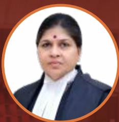
HON'BLE MRS. JUSTICE SUNITA AGARWAL Chief Justice High Court of Gujarat