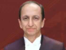
HON'BLE MR. JUSTICE ATUL S. CHANDURKAR

Judge Supreme Court of India 🕒 11:46 AM - 11:54 AM