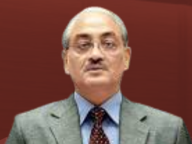
HON'BLE MR. JUSTICE SWATANTER KUMAR

Former Judge Supreme Court of India 🕒 12:02 PM - 12:10 PM