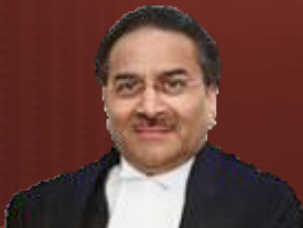
HON'BLE MR. JUSTICE D.K. JAIN

Judge Supreme Court of India 🕒 11:54 AM - 12:02 PM