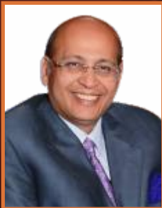
DR. ABHISHEK M. SINGHVI Senior Advocate Supreme Court of India