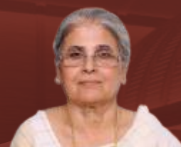
HON'BLE MS. JUSTICE RANJANA P. DESAI

Former Judge Supreme Court of India 🕒 12:10 PM - 12:18 PM