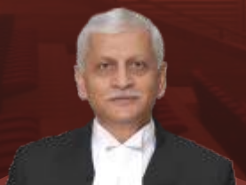
HON'BLE MR. JUSTICE U.U. LALIT

Former Judge Supreme Court of India 🕒 12:34 PM - 12:42 PM