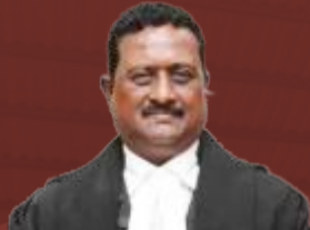
HON'BLE MR. JUSTICE PRASANNA B. VARALE

Judge Supreme Court of India 🕒 11:30 AM - 11:38 AM