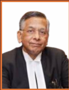
MR. R. VENKATARAMANI Attorney General for India