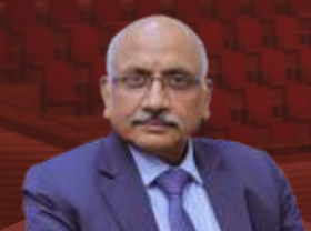
HON'BLE MR. JUSTICE HEMANT GUPTA

Former Judge Supreme Court of India 🕒 12:50 PM - 12:58 PM