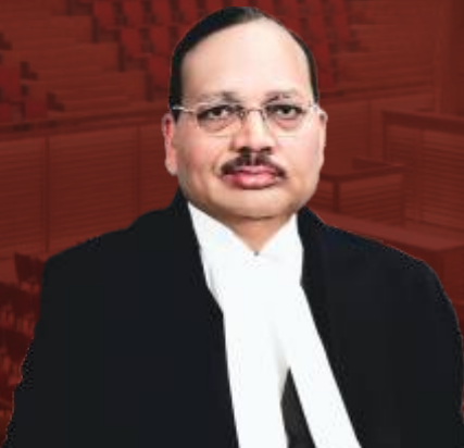
HON'BLE MR. JUSTICE SURYA KANT

DEDICATION of the WORLD'S LARGEST MOOT COURT TO THE NATION