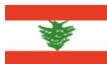
Embassy of Lebanon