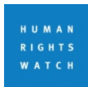
Human Rights Watch