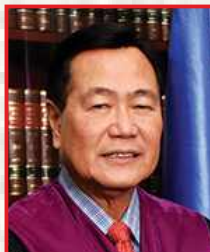
MR. ANTONIO T. CARPIO

FORMER JUSTICE Supreme Court of the Philippines