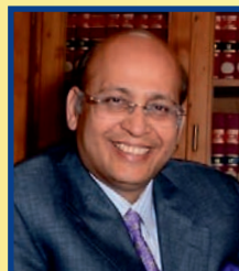
DR. ABHISHEK M. SINGHVI

Simeon E. Baldwin Professor Emeritus of Law, Yale Law School Yale University, USA