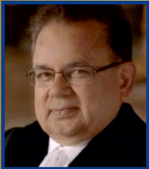
HONOURABLE MR. JUSTICE DALVEER BHANDARI

Governor of New South Wales (NSW) Retired President, NSW Court of Appeal Australia