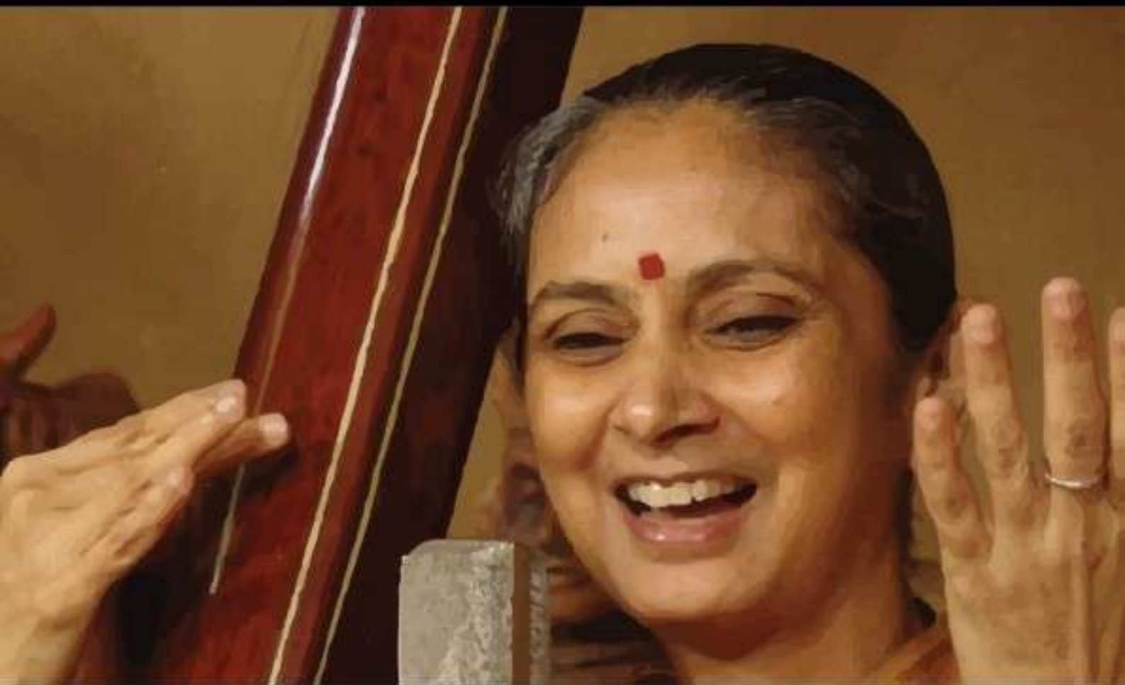
Photograph from the Mahindra Kabira Festival

A session on the need for deep listening, through an engagement with Sufi and Bhakti musical traditions in their sensory, performative, and socio-political layers, and through musical renderings and meanderings of the poetry of Kabir, Khusrau, and Mira.