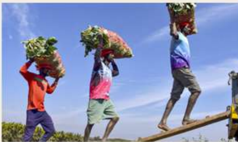
Labourers load sacks of turmeric (coloured) onto a truck at a farm, in Chikmagalur, Karnataka, Jan. 26, 2025.

India's infrastructure push did not fail because investment was insufficient, but because it was structurally disconnected from labour-market realities