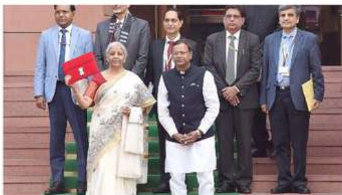
The Indian economic recovery in 2025 was real, but it was also unusually narrow. Government of India

In 2025, India mastered economic stability, but the transition from a US$ 4 trillion to a US$ 5 trillion economy will not be determined by how well risks are contained.