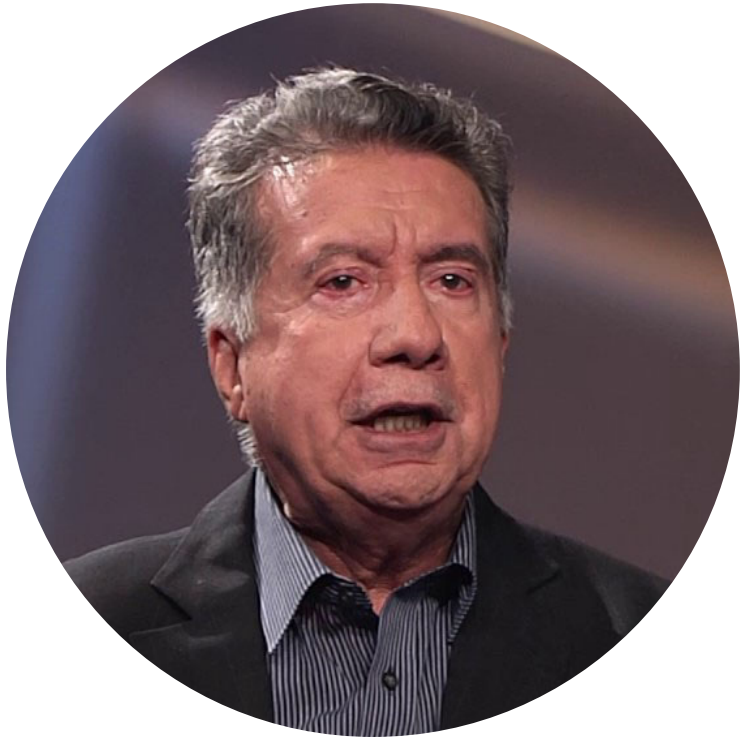
Mr Afrasiab Khattak

Mr. Afrasiab Khattak is a Pakistani politician, intellectual, and activist, who is currently the President of the Roshan Democratic Institute. In 2002, Mr. Khattak was appointed as the president of Human Rights Commission of Pakistan (HRCP). In 2006, he joined the Awami National Party. He was also the President of ANP's central secretariat based in Khyber Pakhtunkhwa Province, as well as Chairman of the special standing committee senate. Additionally, Mr. Khattak was a former Chair of the Pakistan chapter of Pak-India People's Forum for Peace & Democracy. He is an expert on Afghanistan and regional affairs, and a newspaper columnist.