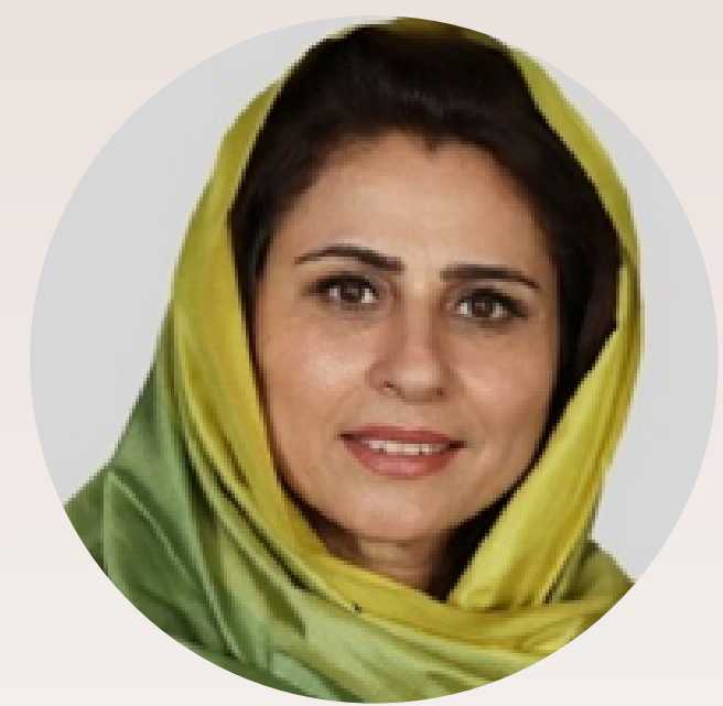
Hon'ble Consul General Zakia Wardak