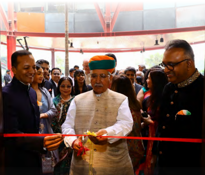
Honorable Minister of State for Law and Justice, Government of India, Shri Arjun Ram Meghwal inaugurating India's first Constitution Museum and The Rights and Freedoms Academy, O.P. Jindal Global University

Designed for aspiring and mid-career election administrators, political professionals, policy analysts, consultants, and democracy practitioners, the programme combines global comparative perspectives with context-sensitive skills. Graduates are well equipped to work across electoral management bodies, political parties, campaign organisations, research institutions, civil society organisations, and international democracy and governance initiatives.