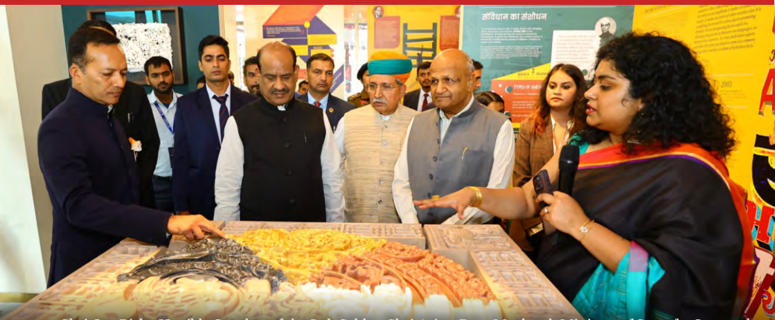
Shri Om Birla, Hon'ble Speaker of the Lok Sabha; Shri Arjun Ram Meghwal, Minister of State for Law and Justice; Mr. Naveen Jindal, Member of Lok Sabha & Chancellor, JGU, at the inauguration of India's first Constitution Museum and The Rights and Freedoms Academy, O.P. Jindal Global University