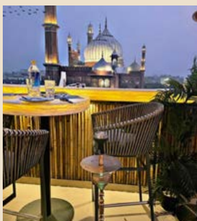
Gumband Cafe, Old Delhi