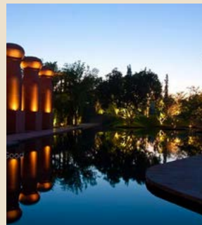
Kiyan, The Roseate