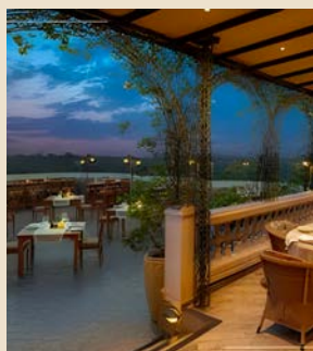
Ottimo West View, ITC Maurya